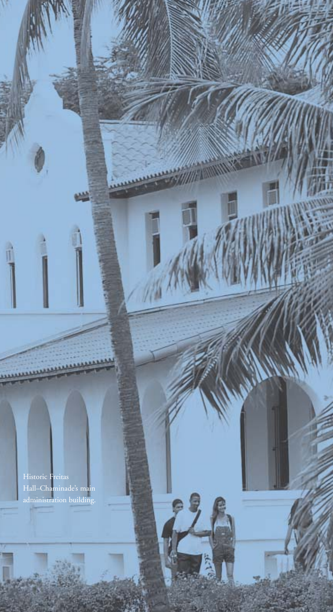
Historic Freitas Hall-Chaminade's main administration building.