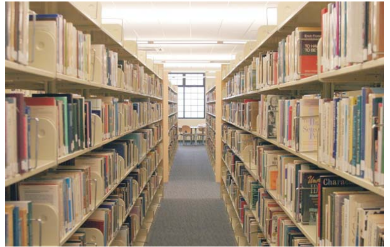
Some of the library's 70,000 volumes in place on the top floor.

She pointed left. "Restrooms!" She gestured toward the back. "A conference room!"