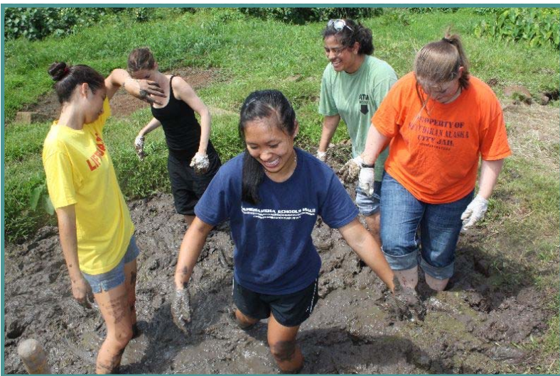
Students working in the lo'i (taro patch), during the CUH 100, First Year Experience course.