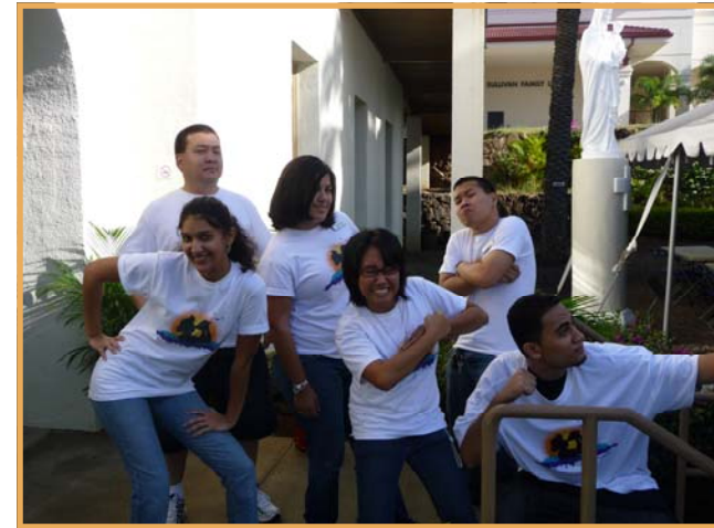
The Orientation Leader 'Ohana!

Aloha new students! We are excited that you will be joining us at Chaminade University and hope you are ready to explore the oceans of opportunity that await you. New Student Orientation is a product of the Student Support Services staff and student orientation leaders. It is also made possible through collaboration with departments across campus.