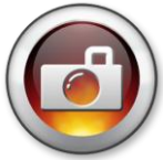
Photo Essay Assignment (DUE May 4, 2012)

Use your Topic Proposal as your outline and create your essay based on your original photos.